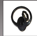
20cm waterproof coil