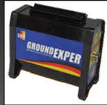
Control box with Bluetooth included