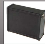
Long-life smart battery