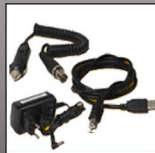
Charger, car charger and USB cable