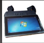
Tablet PC + cover