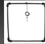
200x200 cm frame 300x300 cm frame