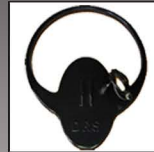
45 cm waterproof coil